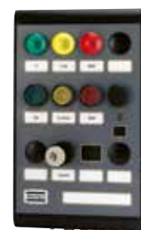
Operator panel Basic