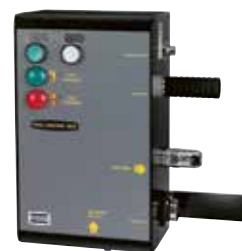
Tool Control Box (TCB)